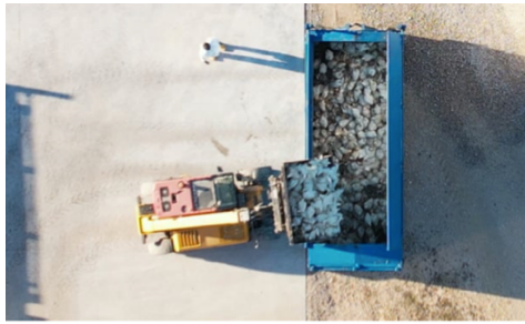
A poultry farm in Italy, dropping live birds into dumpster for culling.

That is correct, hundreds of millions of pounds were spent, not to feed the increasing numbers of starving, but to wipe out 140 million birds that could have fed those starving masses, while proposals to cull wild bird populations (often also blamed from spreading the disease to domestic bird populations) are never made (and I am not suggesting they should be), only human food sources are targeted. Farmers are monetarily compensated for the lost birds while prices for poultry meat of uncultured birds rise along with taxes on hungry citizens, further impoverishing them due to another absurd nonsensical government mandate.