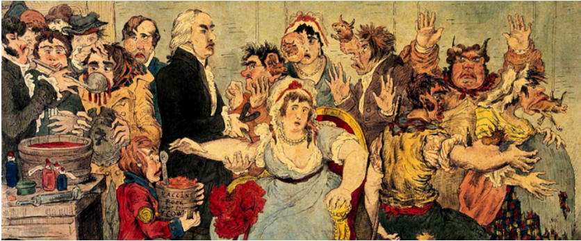
James Gillray, 1802. “The Cow-Pock—or—the Wonderful Effects of the New Inoculation!”