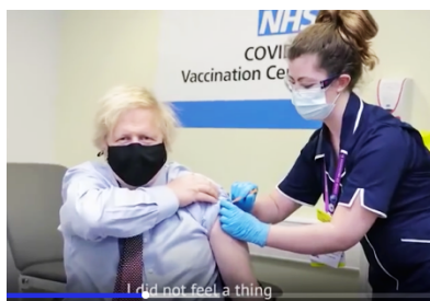
Former British PM, Boris Johnson said he did “not feel a thing,” when he took his Covid cow medicine.

In the meantime, we are incessantly herded into lining up for our injections. We are treated like children, as our leaders (the farm owners), condescend to us, and tell us in a patronizing manner to take our medicine like good little boys and girls, with prominent figures, including the US President and Vice President, and the British Prime Minister publicly getting their own shots to show us that, “see it didn’t hurt” cxxxvi and tell us that is it “good for us.” cxxxvii